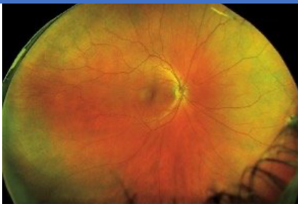
optomap Retinal Image 200°