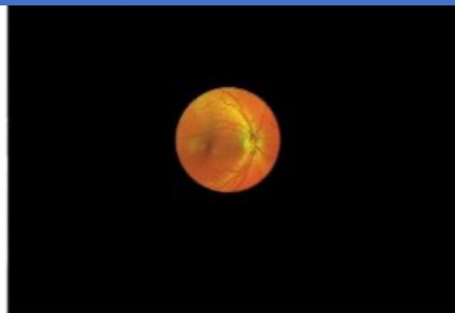
Fundus Camera View approx. 45°